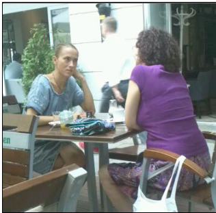
IMG52847-1.jpg21 KБ Показать Загрузить